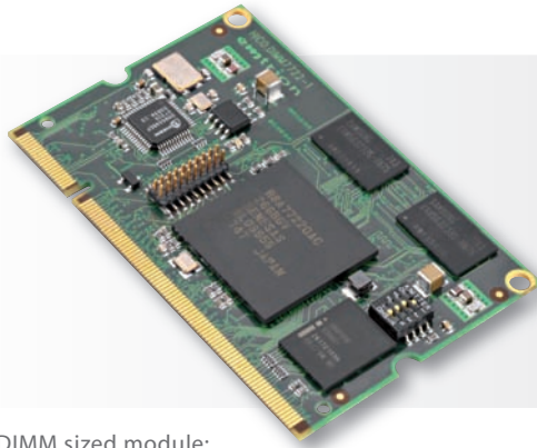
SODIMM sized module: Dimensions: 67.5 mm x 45 mm, top view

SODIMM sized also for your embedded multi media projects